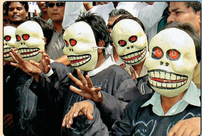
Activists of the Bharatiya Janata Party wearing "evil" masks shout antigovernment slogans near the Union Carbide plant in the central Indian city of Bhopal on the eve of World Environment Day. The activists protested to draw the attention of the government to chemical waste and demanded the cleanup of hazardous waste in the area. The leak from the Union Carbide pesticide plant in 1984 was one of the world's worst industrial accidents, killing 3,000 people and leaving thousands of others with lifetime illnesses.

(2) producing memorable pictures. On these pages are some of our favorite pictures. Please note that to the extent that the Sea Shepherd Conservation Society activists used force to board the Japanese ship (below), we cannot condone their methods. Property damage and violence are never justified; and their use demonstrates a pathetic lack of creative thinking about integrated marketing communications (see Chapter 16).