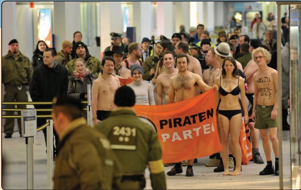
BARING THEIR DISMAY: Members of the Pirate Party parade through Berlin's Tegel Airport in their underwear to protest government plans to test full-body scans as an invasion of citizens' privacy.

(2) producing memorable pictures. On these pages are some of our favorite pictures. Please note that to the extent that the Sea Shepherd Conservation Society activists used force to board the Japanese ship (below), we cannot condone their methods. Property damage and violence are never justified; and their use demonstrates a pathetic lack of creative thinking about integrated marketing communications (see Chapter 16).